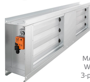
MAK E ... F 02 With actuator 3-point control