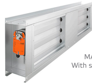
MAK E ... F 01 With spring return (VDI 6022)