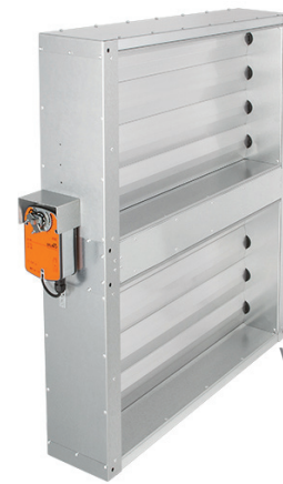
MAK ... V 01 With spring return (VDI 6022) MAK ... V 02 With actuator 3-point control