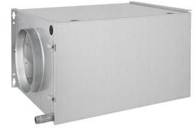
DVR 250 02 Left