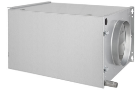
DVR 250 01 Right